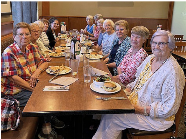
Lunch at White Spot