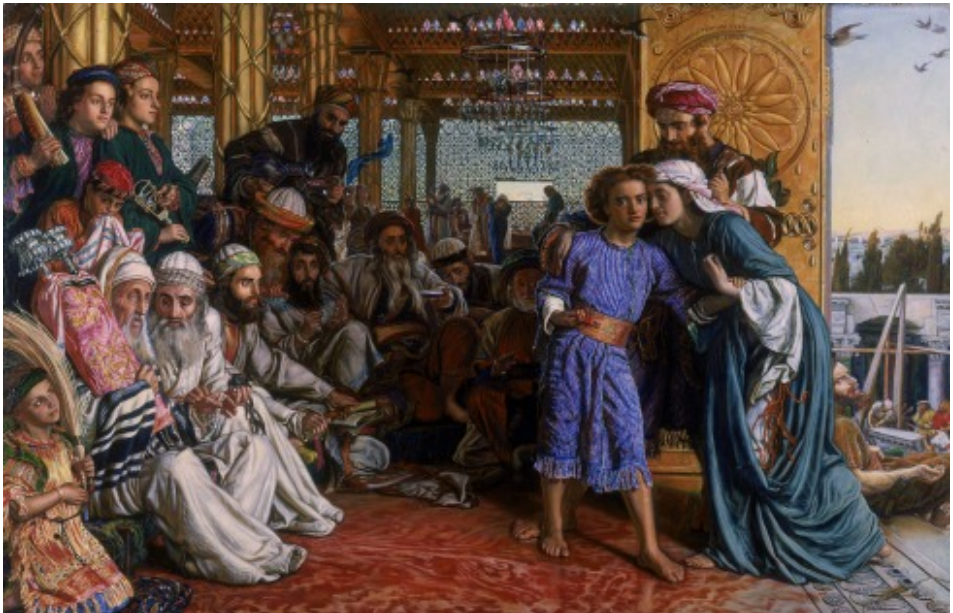
Jesus at the Temple

Church Office: 250 748-2122 Church Hall: 250 748-2109 Fax: 250 748-2365 Office E-mail: crc.duncan@shawcable.com